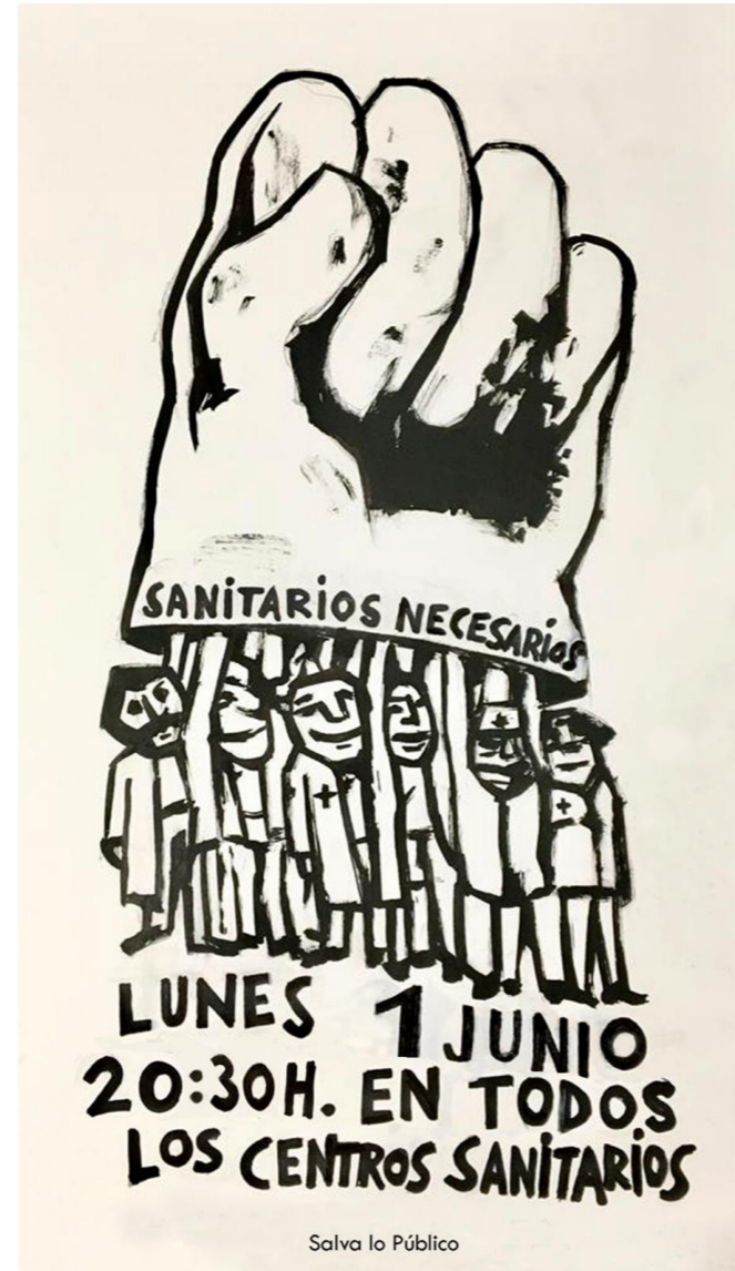
Call launched by the “Sanitarios Necesarios” movement on 30 May 2020

doctors’ union in Madrid, announced the call for an “indefinite and complete” strike in response to a “unanimous request” from workers. In a statement on 10 September the doctors denounced “a situation of overloaded care for years, with a significant deficit of human resources”. According to their figures, there was a shortage of more than 600 family doctors and more than 150 paediatricians in the community, even before the COVID-19 pandemic.