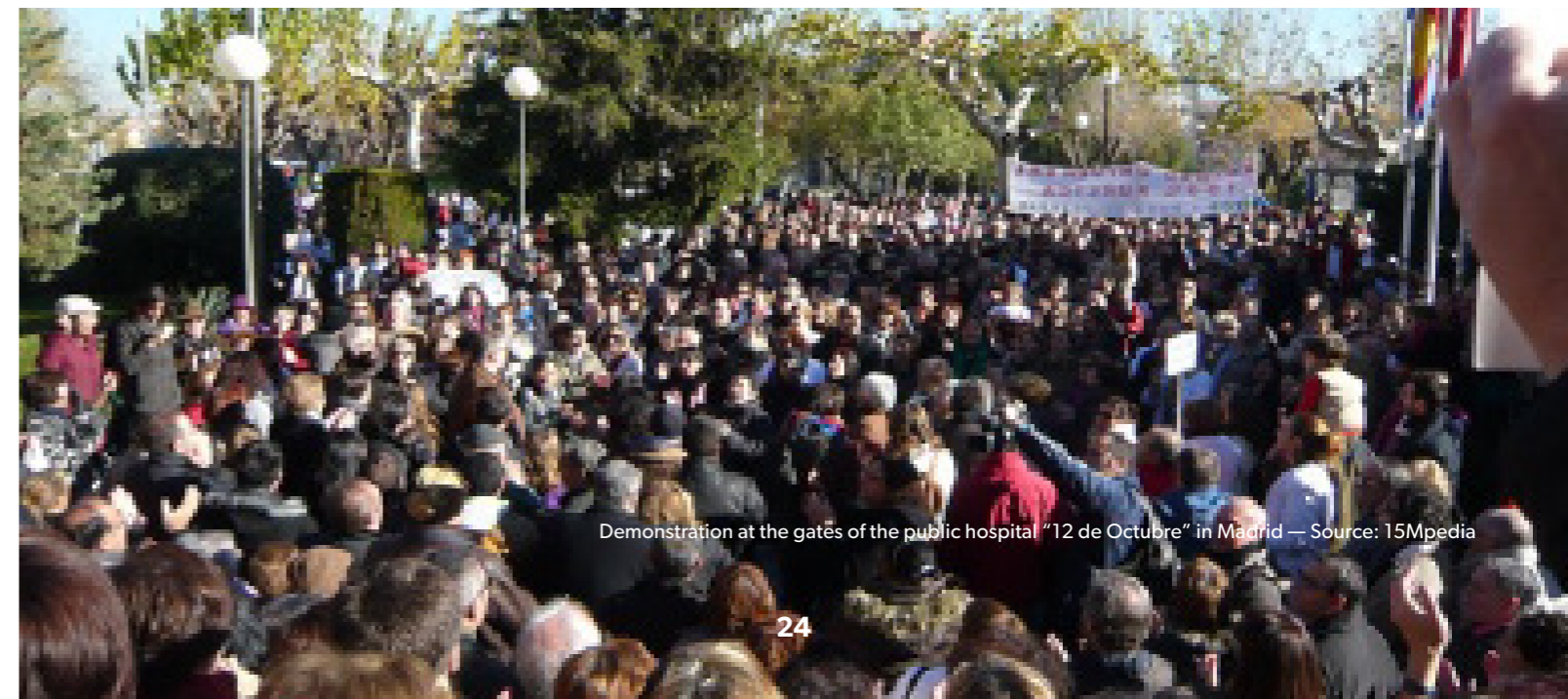
Demonstration at the gates of the public hospital “12 de Octubre” in Madrid

Following an appeal against this decision by the government, the Court upheld its decision against the privatisation plan. On 14 January 2014 the president of the government, Ignacio González, announced that he would abandon the plan to privatise the public health system and the minister of health, Javier Fernández-Lasquetty, resigned. In 2019 Fernández-Lasquetty returned to the Madrid government as the new Minister of Finance and Public Function in the government of Isabel Díaz Ayuso, a position he still currently holds and which makes him one of the main political interlocutors in the present conflict.