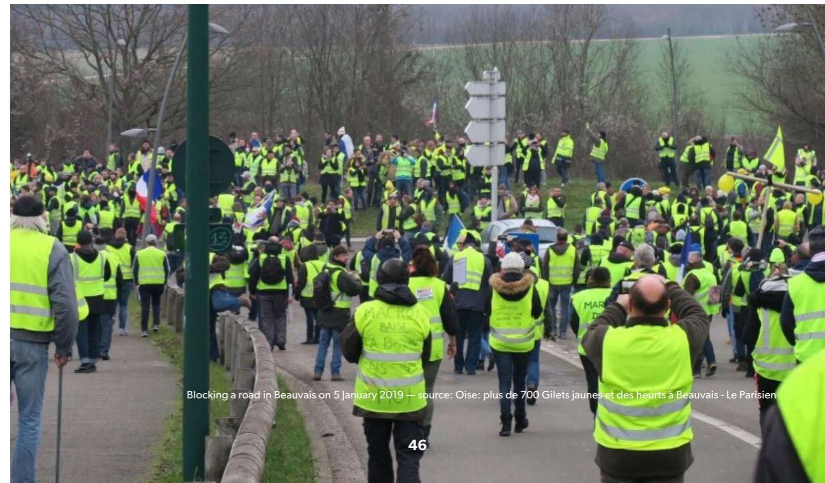
Blocking a road in Beauvais on 5 January 2019

After three weeks of blockades, the activists came to France's main cities. From now on, the mobilisation was characterised by big demonstrations, every Saturday, gathering several hundred thousand people. The Yellow Vests movement took on a new dimension over the weeks: faced with the success of their mobilisation, the activists took up broader claims concerning their purchasing power but also "tax justice" as well as a constitutional reform and the establishment of a "citizens' initiative referendum" (RIC), allowing greater participation of citizens in democratic processes.