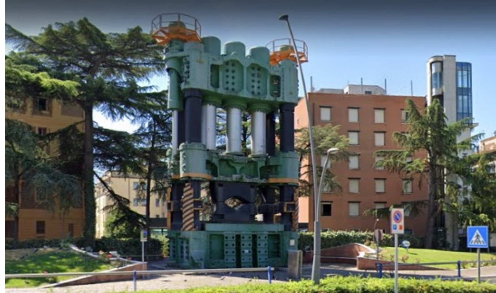
12-tonne press placed in front of the exit of the railway station of Terni

To begin to introduce the case of AST, it is imperative to make clear the close relationship it has with the city of Terni, to such an extent that this latter is itself referred to as the 'City of Steel'. Figure 1 above shows the relative sizes of the production plant (on the right side) and the city (on the left).