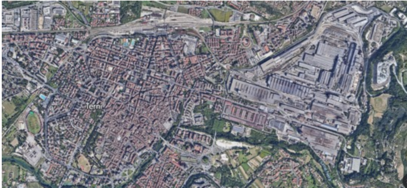
Terni, 'City of Steel'

The case chosen for this study is the factory of Acciai Speciali Terni (henceforth, AST), a company operating in the steel sector and specialised in the production of stainless steel. Its production site is just next to the city of Terni, in the Umbria region, in the very centre of the country. It was chosen based on the fact that this production site is a pivotal player in Italian industrial history, although it is currently going through a phase of transition and reconversion due to its recent purchase by the Arvedi group. In fact, the steel mills are currently in a situation of under-production, producing only 600,000 tons of cold rolled steel, despite the plant and labour capacity to produce 1,500,000 tons of liquid steel 1 . This production capacity rests on a decidedly fragmented factory and work organisation, having contracts with about 130 outsourced companies, as the Secretary General of FIOM-CGIL Terni reported to me.