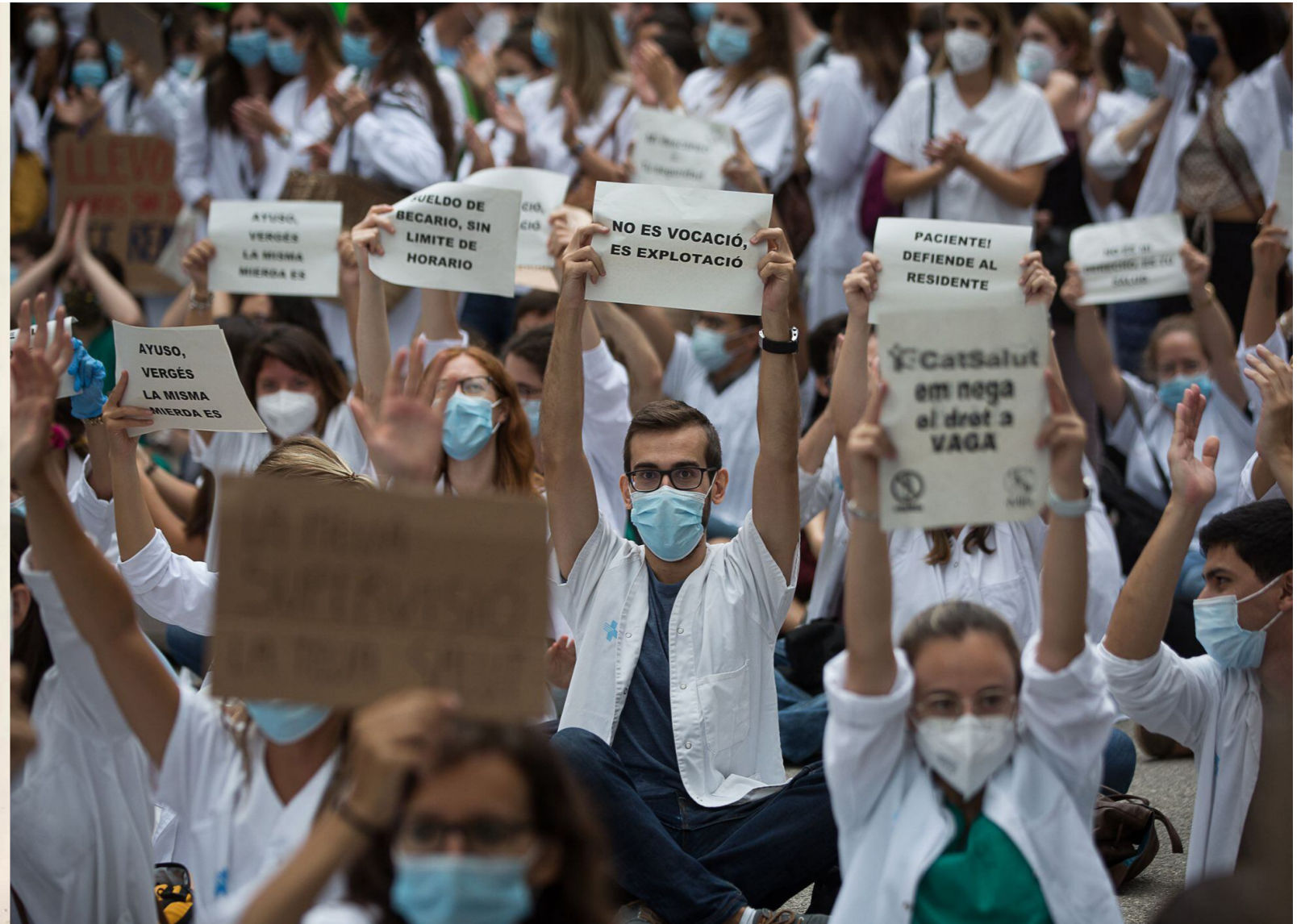
MIR at one of the protests in September in Barcelona.

According to AMYTS members, this, together with “the shortage of economic resources and the worsening of the situation in recent months due to the pandemic” had led to “an unbearable extreme” of